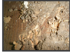
Live termites in cellulose

Finding out your home has termites can be scary. You typically can't see them, you can't hear them and frequently only a trained inspector can find signs of an infestation. Do-it-yourself treatments for the control of termites are virtually impossible. Only trained experts have the necessary knowledge and expertise for effective control. A trained termite control specialist can provide protection from termite infestations.