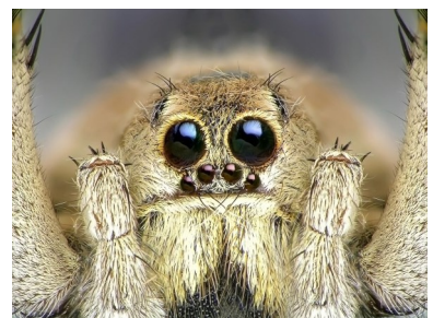
Spiders may be a necessary part of nature, but they don't need to be a part of your home!

Find photos, videos and other interesting information on our page!