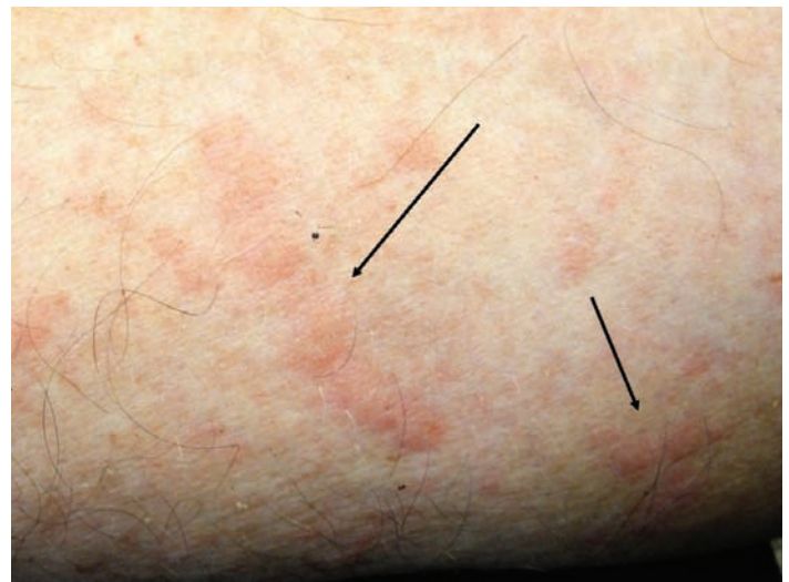
Figure 6. Bed bug bites

Both nymphs and adults typically feed at night but hide in nearby crevices and cracks during the day. Their small size and flattened bodies make it easy for them to hide in the seams of mattresses and box springs, cracks in bed frames and bedside tables, under loose wallpaper, behind wall hangings, and in other furniture. Although bed bugs do not live in nests or colonies, they tend to congregate around good hiding places. These areas are usually evident because they are stained with dark red to blackish spots, which is dried bug excrement (Figure 4). There may also be eggs, eggshells, and the brownish molted skins (exuviae) of the maturing bugs (Figure 5).