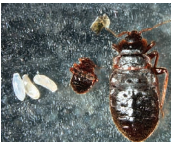
Figure 2. Eggs, nymph, and mature bed bug