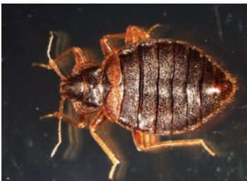
Figure 1. Bed bug

In recent years, infestations in homes, hotels, dormitories, and other locations have increased. Bed bugs are most often associated with clutter and filth but have also been reported in the finest hotels and living accommodations. Although there is no specific explanation for the resurgence of this pest, increased international travel and pesticides with reduced residual activity have probably contributed.