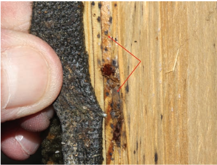
Figure 4. Dried bug excrement